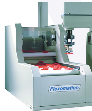
FF250 with Robot